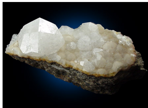
Analcime on Thompsonite, North Table Mountain, near Golden, CO