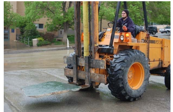
Jade tabletop being unloaded from truck with a fork lift in ~2009.