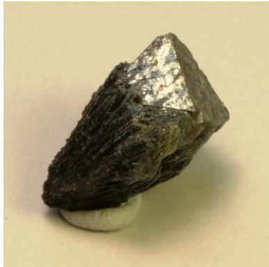
Magnetite (1 cm) on Tremolite Sedalia Mine Salida, Chaffee County, Colorado (Collected by Rigel Reynolds.)

Not all metamorphic rocks contain striking crystals or interesting minerals: for example, quartzite from metamorphosed quartz sandstone is a hard rock consisting of rather plain recrystallized quartz. Our attention will focus on more sophisticated metamorphic rocks containing collectable minerals including so-called index minerals which offer insight into the pressure and temperature under which the rock recrystallized. We will also discuss skarns that formed as granitic magmas came into contact with sedimentary limestone or dolomite rock. Presentation of these concepts will be accompanied by stories of field collecting.