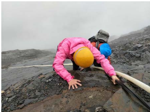
Accessing some of the outcrops and workings.