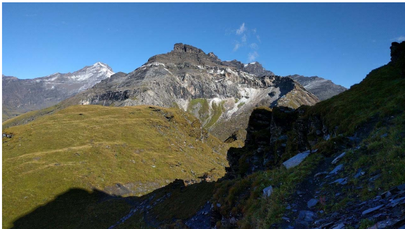
Xuebaoding (雪宝顶) Mountain (background). The localities are in small adits and artisanal pits just above the talus slope and beyond the ridge to the right.

The Xuebaoding Mountain with its W-Se-Be deposits has emerged as a world-class specimen locality for scheelite, cassiterite, and beryl since its discovery in the 1950s. Situated high above tree line on the northeastern edge of the Tibetan Plateau, the mineralized muscovite-rich quartz veins intruding Triassic metamorphic schist and carbonate rock are of a greisen-type associated with small alkali granite intrusions. Major gem-grade scheelite, beryl, and cassiterite are found with minor K-spar, quartz, fluorite, calcite, and rare Sn-bearing minerals mushistonite, kësterite, and others. Difficulties in access of this remote locality above 4200 m have long limited systematic research of its geology and mineralogy. I will discuss recent progress and new insight into the mineralogy which resolve a number of mysteries surrounding this deposit.