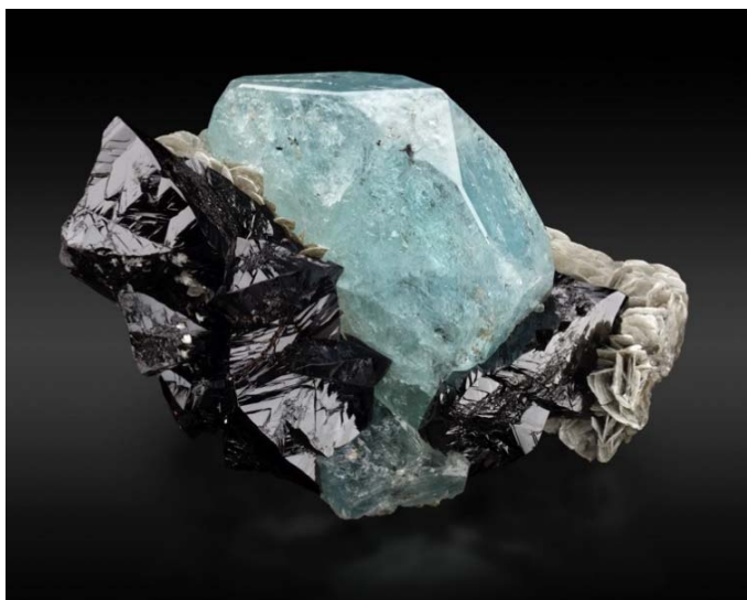
Right: Beryl (var. aquamarine) with cassiterite. Xuebaoding, 21.0 x 13.0 x 10.0 cm. Collection MIM museum.