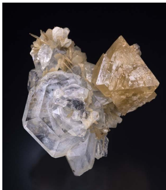
Scheelite with beryl in typical tabular habit. Xuebaoding, 4.2 x 3.7 x 2.2 cm. Collection and photo Yasu Okazaki.