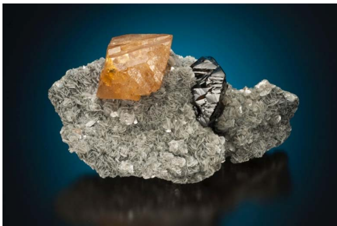
Scheelite with cassiterite on biotite. Xuebaoding, 11.7 cm. Collection Steve Smale.