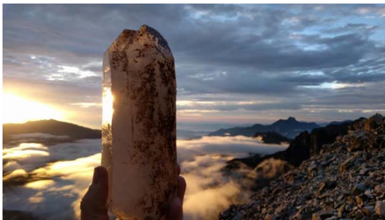
A quartz crystal above omnipresent Sichuan cloud soup to the east at sunrise.