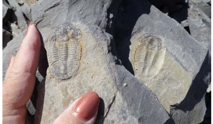
One of our better finds at the trilobite dig.

Our next stop on the drive was Lassen Volcanic National Park. It's a relatively small park, but it has great scenery and geothermal features - sort of like a mini Yellowstone. Mt. Lassen last erupted about a hundred years ago, in 1915. It was interesting to see how much the land had and had not recovered in that time. Lassen Peak is one of the world's largest plug volcanoes, and it rises 2000 feet above the surrounding landscape. They've got a great visitors' center, and lots of hiking trails. Unfortunately, we couldn't take in all that there is to see there, so we mostly did a drive through of the park with several stops along the way, before heading up to Oregon that night.