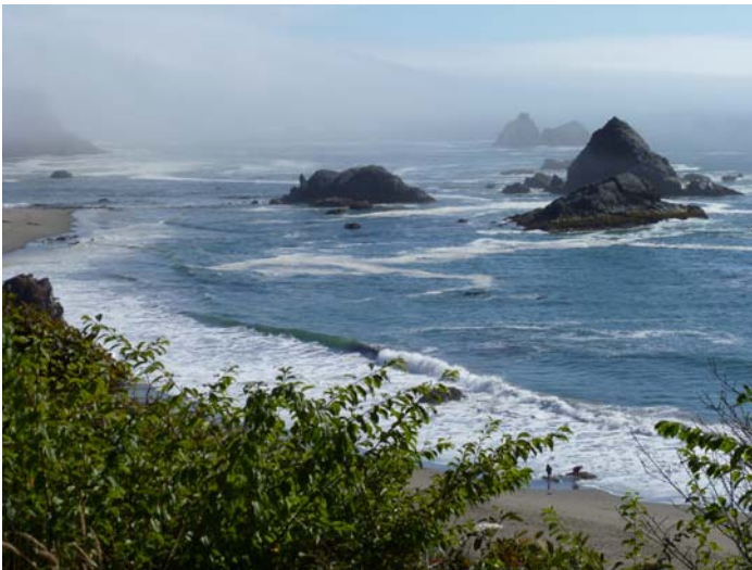
A scene along the southern Oregon coast

While in Oregon, we spent a weekend along the beautiful southern coast, where we searched for agates on the beaches (without much luck). We returned to the Crater Rock museum in Central Point, which I wrote about last year, and enjoyed seeing their world class specimens. Besides specimens for sale in the gift shop, they have piles of cutting material and petrified wood that is for sale by the pound behind the museum. We also spent time visiting vineyards and picking blackberries to make preserves, and took a tour of the Harry and David factory and packing plant.